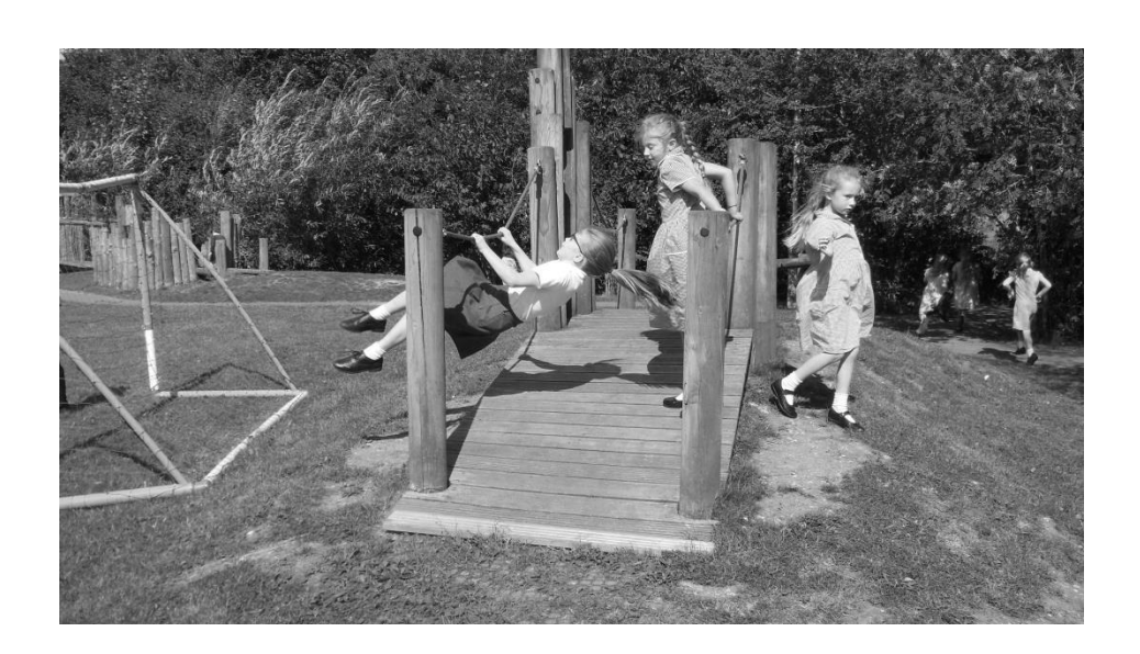
".. the strengths are summed up in the school motto ... A genuinely caring environment where standards are high and as a result children flourish." (Parent comment – Governors' questionnaire, 2017)